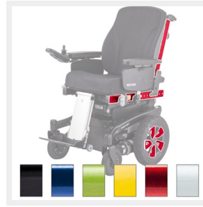
Colours - wheel rim, frame accent & guard accent