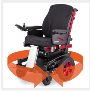
Manoeuvre around obstacles or turn on the spot