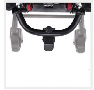
Single or double support castor